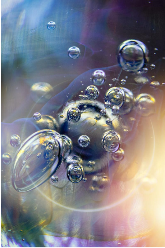
COSMIC CRUSH 18" x 14" Nicol Hockett First Place

The harmonious design of Cosmic Crush , using different sizes of orbs and variations of shape, mesmerized me. The predominantly cool background with soft shade of light made me feel like these bubbles were floating in space; their arrangement felt like either clusters of stars or orbiting planets from another galaxy.