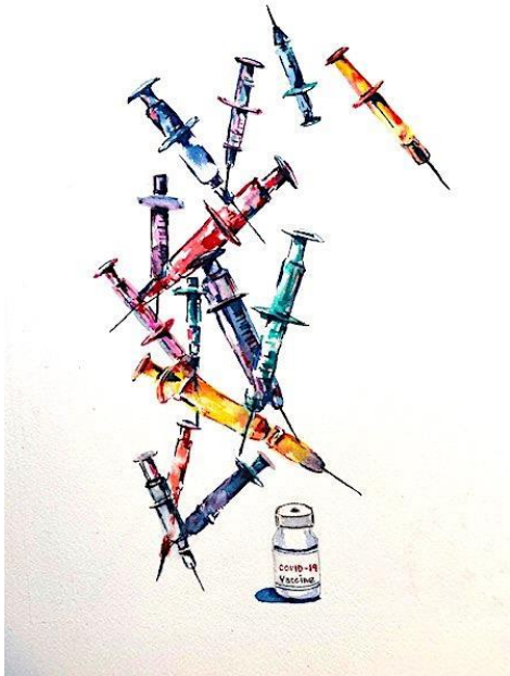
GALAXY OF HOPE 2021 14" x 11"