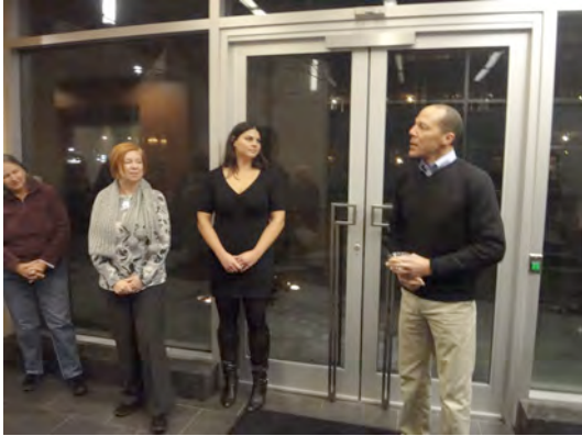
Velocity Condo opening