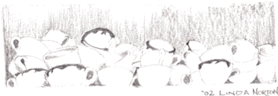
'02 LINDA NORTON

Thank you all for the great food and good meeting last April. The survey cards were tabulated, and we found that the greatest interest is in a workshop on photographing artwork. In addition, there is interest in a sketchbook workshop, watercolor technique classes, and developing web sites. There is a good chance that the last option will be offered for free. Stay tuned.