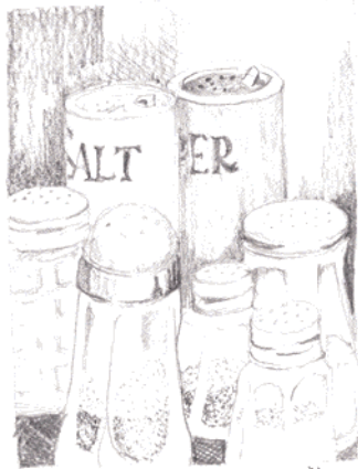
'02 LINDA NORTON