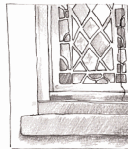
Triangular panes in the center make an etched floral pattern. Fleur-de-lis (?) in the center with two fleur-de-lis on each side. The center is clear deep red and blue glass but so shaded that only a few panes actually show color.