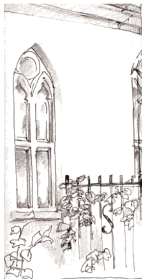
Refrain garden in the shade. June 27, 2002 about noon. Foreground plants are in full sun, windows and shade created. Walls are rough with pebbles (stucco?) wood is dark-stain.