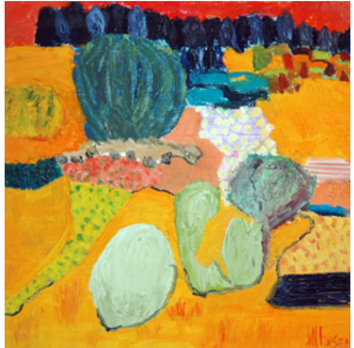
Blue Poplars Jill Finsen Oil on Board

The CHAW Photography show will be moving to January next year, so our season begins a month earlier in September. We will have 4 themed shows, our usual