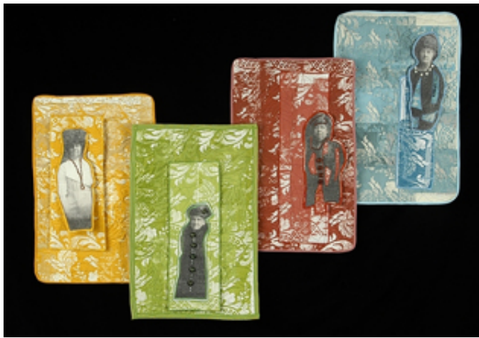
The Women Sara Brown Fabric