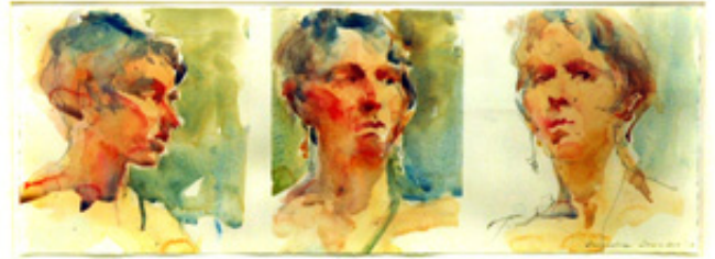
Three Views of Sasha Jackie Saunders Watercolor